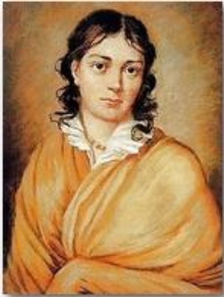
Katharina von Schlegel 1697–1768

Katharina was born in Germany, on October 22, 1697, twelve years after Johann Sebastian Bach, who was born 80 miles away . Katharina's last name, von Schlegel, indicates that she was likely born to an aristocratic family. Germany, in the late 1600s and early 1700s was largely Lutheran and was experiencing a religious revival known as the Pietistic Revival. Philipp Jacob Spener was the leader of this movement, which encouraged small Bible study groups, personal works of righteousness and congregational hymn singing. The Pietists also encouraged laymen in the church to express their devotion by writing hymn texts. Katharina is said to have written 29 hymns and several were published in 1774 in a collection of spiritual songs, . Her writing was shaped