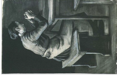
Helen Howarth Lemmel 1863-1961

The frail old woman sits at a table in her tiny room in Seattle, Washington. Before her is a small plastic organ—one such as a child might have. But, as she fingers the keys and sings, her poor surroundings seem to fade from view, her face shines with the light of heaven, and tears trickle down her time-lined cheeks. Perhaps in her mind she is seated at a majestic pipe organ in some ornate cathedral. But the place doesn't matter. She is intent on worshipping her Saviour.