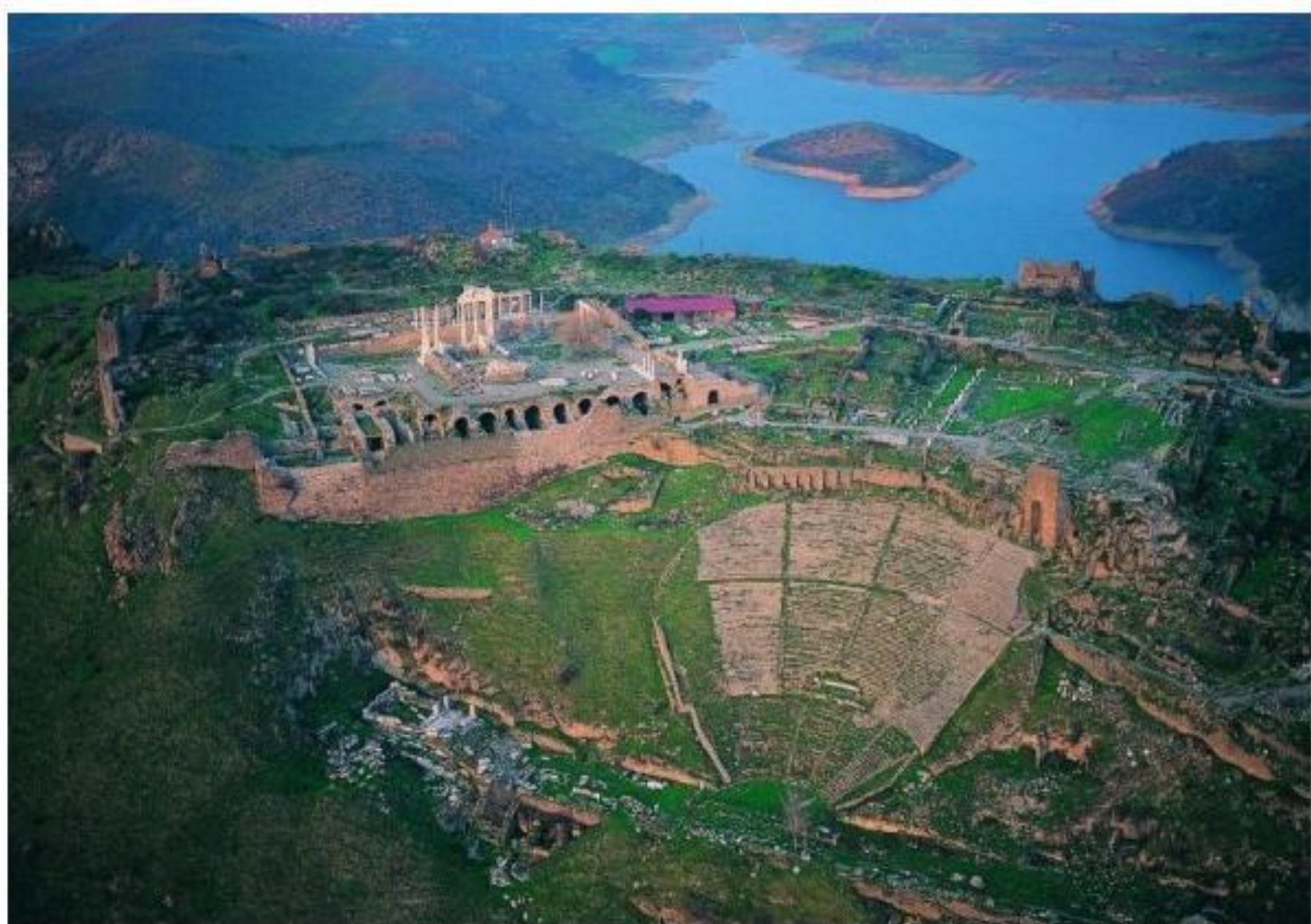
Ariel View of Ancient Pergamum