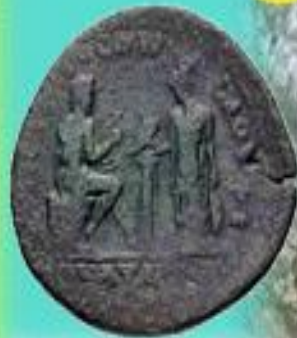
Thyatiran Coin showing Hephaestus as a Bronzesmith (Commodus. 180-192 CE)