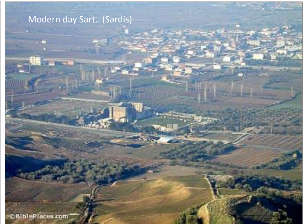
Modern day Sart. (Sardis)

6 'He who has an ear, let him hear what the Spirit says to the churches.'