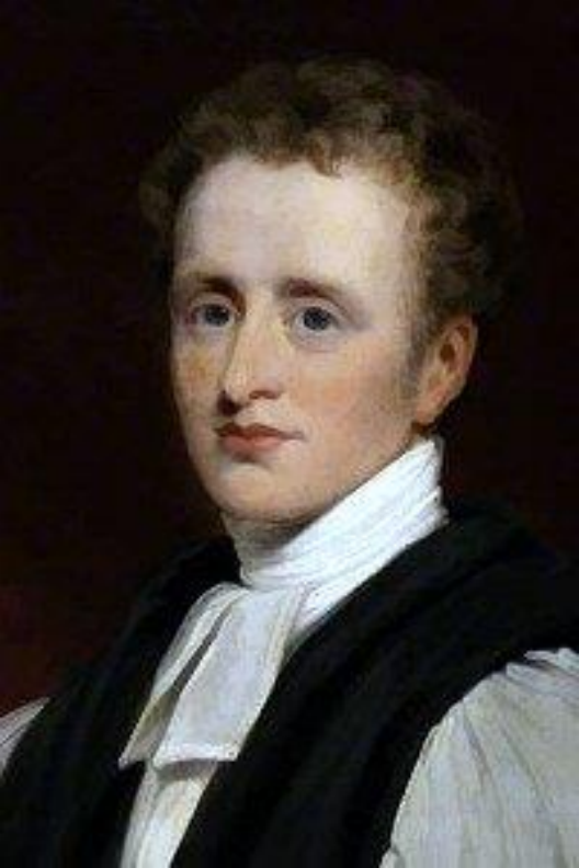
Reginald Heber 1783-1826

Reginald Heber was born at Malpas, Cheshire, England, April 21, 1783 to a heritage of wealth and culture. By the age of five, he had read the Bible so thoroughly that he could give chapter and verse for chance quotations.