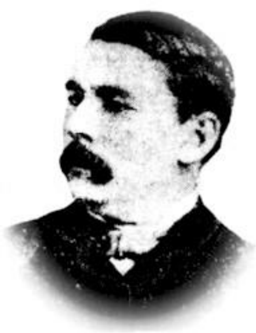
Joseph Scriven 1819-1886