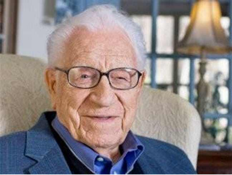
George Beverly Shea 1909 - 2013