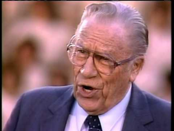
George Beverly Shea 1909 - 2013

Billy had traveled from Wheaton College on a train to stop by and say “hello.” Bev Shea began working with the Billy Graham Evangelistic Association in 1947 as gospel soloist. Following the 1949 Los Angeles crusade, Billy Graham’s ministry gained international notoriety.