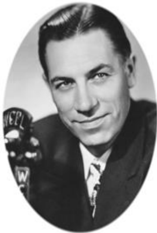
George Beverly Shea 1909 - 2013