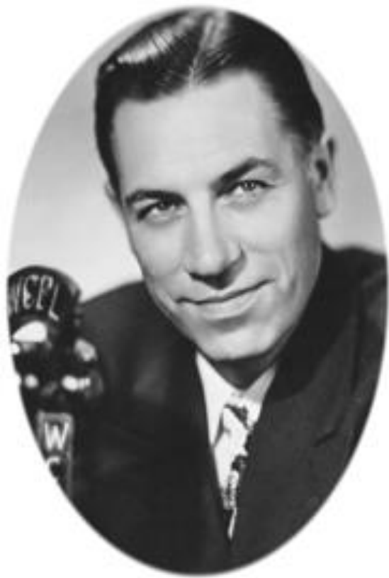
George Beverly Shea 1909 - 2013

I took lessons for a while, but I found out that I would rather just develop different chords in all the different keys and play by ear. I don't do it for people today, but I still play like this for my wife and for my own enjoyment morning and night." Although he became a Christian as a young boy, he recommitted his life to Christ at the age of eighteen. For a time he attended Annesley College in Ottawa and later transferred to Houghton College in New York where he studied music. When his funds were depleted he dropped out in 1929 and took a job with Mutual Insurance Company of New York as a medical clerk. His work involved assisting medical examiners in gathering information about a policy applicant's health history. In the course of his work he made the acquaintance of Fred Allen, host of a coast-to-coast radio talent show.