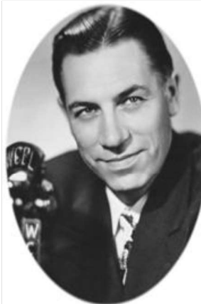
George Beverly Shea 1909 - 2013