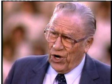
George Beverly Shea 1909 - 2013