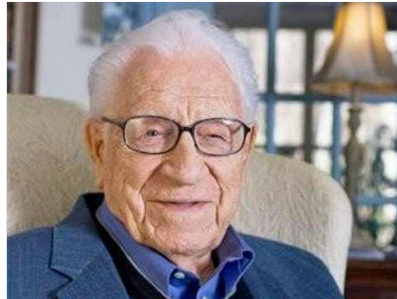
George Beverly Shea 1909 - 2013

Bev Shea was honored by the Guinness Book of World Records for having sung before more than 220 million people – more than anyone in history.