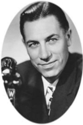
George Beverly Shea 1909 - 2013

I took lessons for a while, but I found out that I would rather just develop different chords in all the different keys and play by ear. I don't do it for people today, but I still play like this for my wife and for my own enjoyment morning and night." Although he became a Christian as a young boy, he recommitted his life to Christ at the age of eighteen. For a time he attended Annesley College in Ottawa and later transferred to Houghton College in New York where he studied music. When his funds were depleted he dropped out in 1929 and took a job with Mutual Insurance Company of New York as a medical clerk. His work involved assisting medical examiners in gathering information about a policy applicant's health history. In the course of his work he made the acquaintance of Fred Allen, host of a coast-to-coast radio talent show.