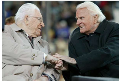
George Beverly Shea 1909 - 2013

I took lessons for a while, but I found out that I would rather just develop different chords in all the different keys and play by ear. I don't do it for people today, but I still play like this for my wife and for my own enjoyment morning and night." Although he became a Christian as a young boy, he recommitted his life to Christ at the age of eighteen. For a time he attended Annesley College in Ottawa and later transferred to Houghton College in New York where he studied music. When his funds were depleted he dropped out in 1929 and took a job with Mutual Insurance Company of New York as a medical clerk. His work involved assisting medical examiners in gathering information about a policy applicant's health history. In the course of his work he made the acquaintance of Fred Allen, host of a coast-to-coast radio talent show.