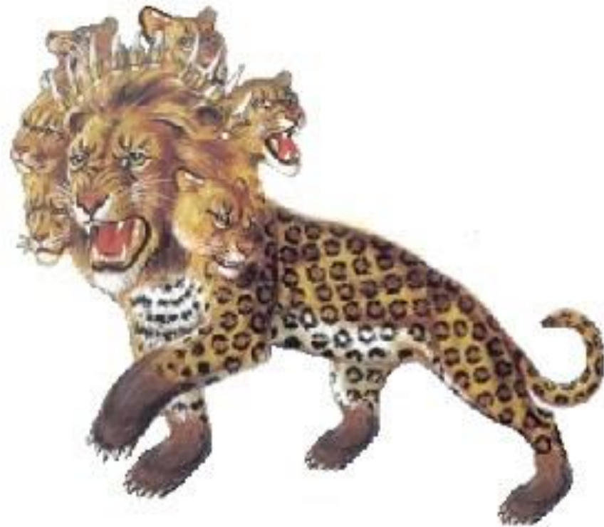
Beast (Revelation 13)