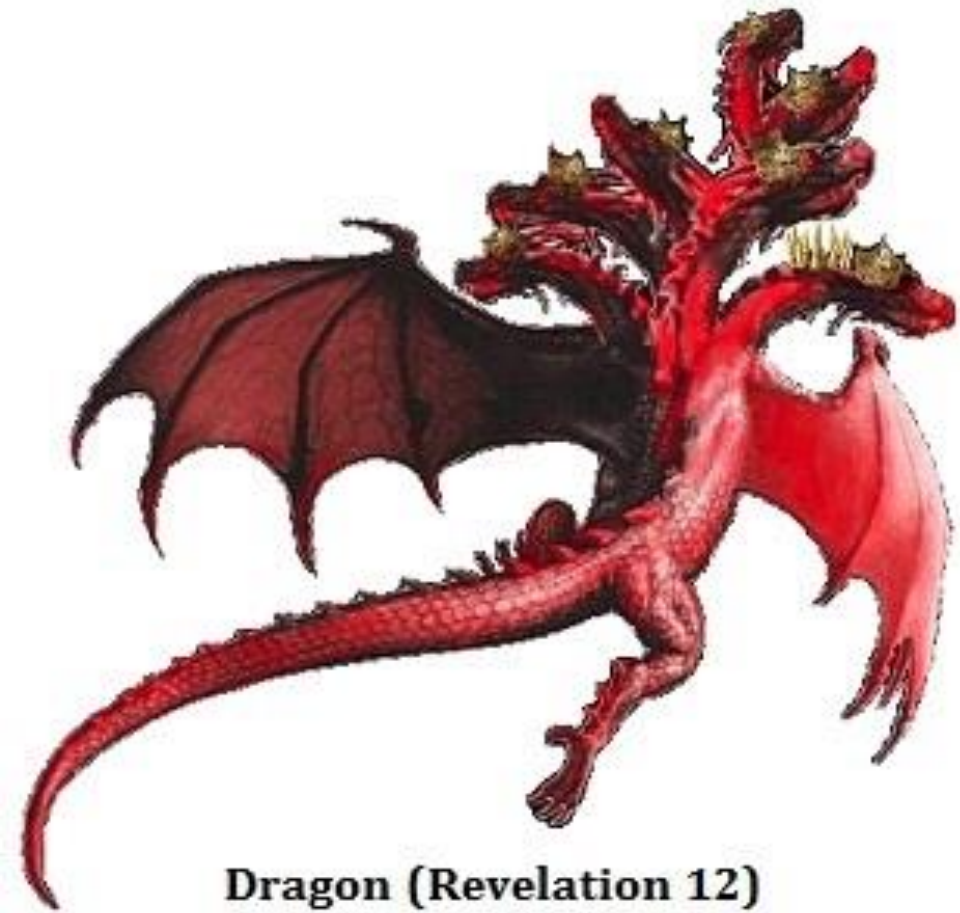
Dragon (Revelation 12)