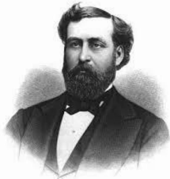
Philip P. Bliss (1838-1876)

IN the year A. D. 62 a certain Roman citizen was cast into prison because of a multitude of accusations against him. At his hearing before Festus he appealed to Caesar for justice, and was held for trial at Rome. Shortly afterward he was asked to state his defense before King Agrippa and Bernice, who were then visiting Festus. That defense, uttered by Paul for he was the accused prisoner is found in the twenty-sixth chapter of the Acts of the Apostles, and is one of the greatest addresses to be found in the Holy Scriptures. At the conclusion King Agrippa said to Paul: "You have almost persuaded me to be a Christian" to which Paul replied, "I would to God that not only you, but also all that hear me this day, were both almost and altogether such as I am, except these bonds."