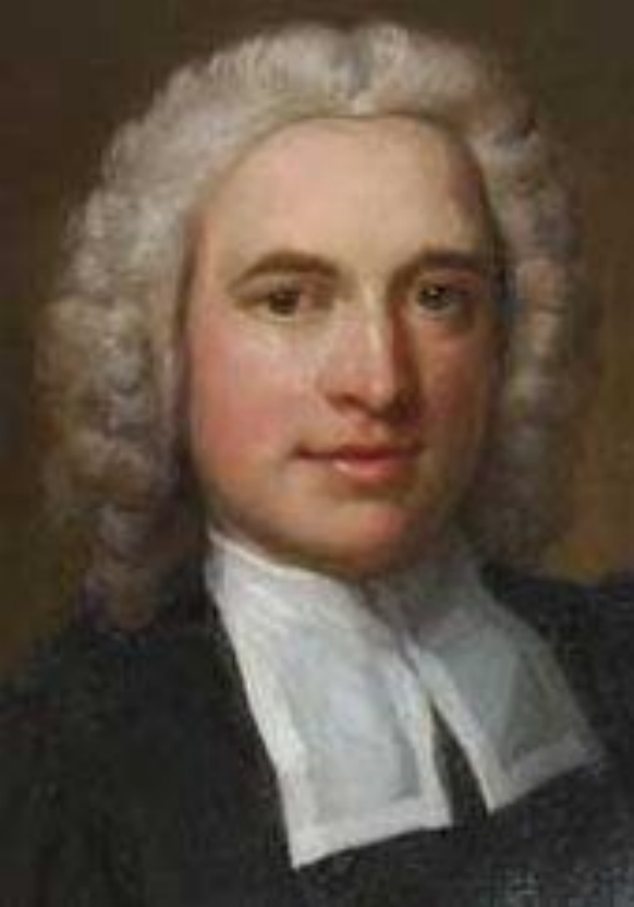
Charles Wesley (1707–1788)

Many of the carols we sing have a rich theological tradition, and this hymn we are looking at tonight is no exception. It was written by Charles Wesley, who was an English Methodist leader and hymn writer. Wesley wrote over 6,000 hymns, more than any other male writer (Fanny Crosby wrote 8,000). His hymns include “O for a Thousand Tongues to Sing,” “Jesus, Lover of My Soul,” “Christ the Lord Is Risen Today,” and “Love Divine, All Loves Excelling.”