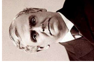
Phillips Brooks (1835–1893)

But this position he was not to fill for long. The strain of the great work he had been doing had undermined even his giant strength, and after a short sickness he passed away on January 23rd, 1893 at age 58 years. When Phillips Brooks was pastor of Holy Trinity Church in Philadelphia, his parishioners in August 1865, sent him abroad for a year. His travels took him through Europe, and in December to the Holy Land. Here with reverent feet he traced the footsteps of his Lord and Master from Nazareth southward and visited the scenes of the Bible narrative. After two weeks spent in Jerusalem, on December 24th he made his way on horseback from Jerusalem to Bethlehem where he attended a five-hour Christmas musical praise celebration at the Church of the Nativity.