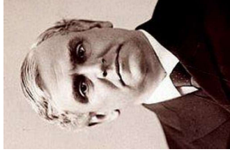
Phillips Brooks (1835–1893)

Phillips Brooks was born in Boston, December 13th, 1835. He came from a long line of Puritan ancestors, many of whom had been Congregational clergymen. His parents became connected with the Episcopal Church, and he was reared in the strict ways of the Evangelical wing of that Church. He had the typical Boston education, the Latin School and then Harvard, from which he was graduated in 1855. Brooks was an American patriot, fighting for the union in the Civil War and standing against slavery. He held a Doctorate of Divinity from Oxford and taught at Yale University. Standing at 6 feet, 8 inches he was loved by young and old alike. He is reported to often be seen sitting on the floor playing with children that visited his office and keeping toys in his office for his young visitors. He soon decided to enter the ministry, and studied at Alexandria Seminary, in Virginia.