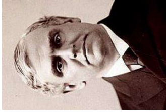
Phillips Brooks (1835–1893)

His organist put melody to his words and on Christmas Eve, 1868, this hymn was sung for the very first time. Neither Phillips Brooks nor his organist ever thought the carol or the music to it would live beyond that Christmas of 1868. The name of this hymn and Christmas carol is . . .