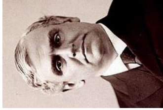
Phillips Brooks (1835–1893)

Next time we will look at the reaction of those who made it our of Babylon alive.