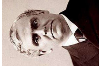
Phillips Brooks (1835–1893)

In 1859 he became pastor of a small church in Philadelphia. Here his sermons attracted much attention, and in 1861 he was called to be minister of the Church of the Holy Trinity, in the same city. In that position he remained until 1869, when his own leanings toward his native town and the urgency of repeated calls from there led him to accept the pastorate of Trinity Church, Boston. The congregation built for him the great church building in the Back Bay, and there he exercised that wonderful ministry with which many of us are familiar. In 1891 he was elected pastor of his Church in Massachusetts, and after some controversy, occasioned by his broad views in church matters, his election was confirmed and he was consecrated.