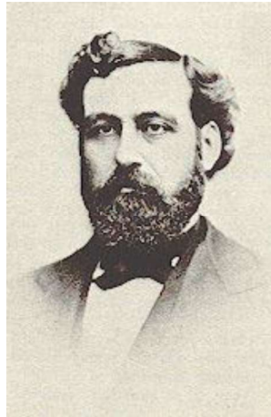
Philip P. Bliss (1838–1876)