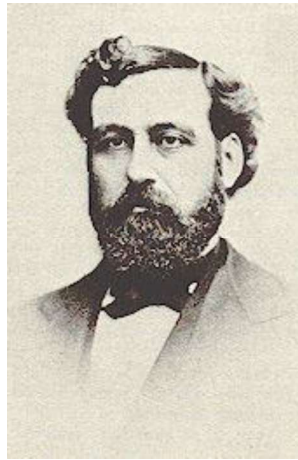
Philip P. Bliss (1838–1876)

Next week we will see another great event – the marriage of the Lamb.