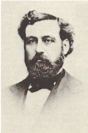
Philip P. Bliss (1838–1876)