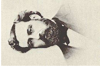
Philip P. Bliss (1838–1876)