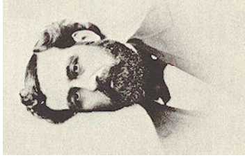
Philip P. Bliss (1838–1876)