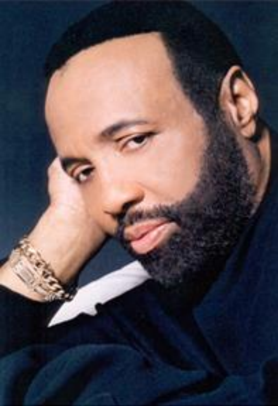
Andrae Crouch 1942-2015