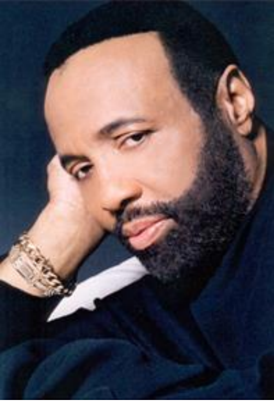
Andrae Crouch 1942-2015