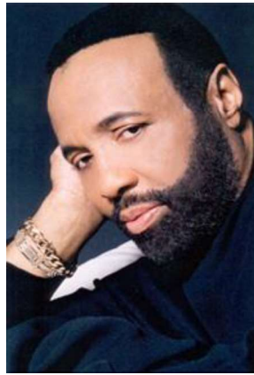
Andrae Crouch 1942-2015

Next week we will answer those questions as we come to the battle of Armageddon.