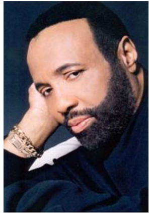
Andrae Crouch 1942-2015