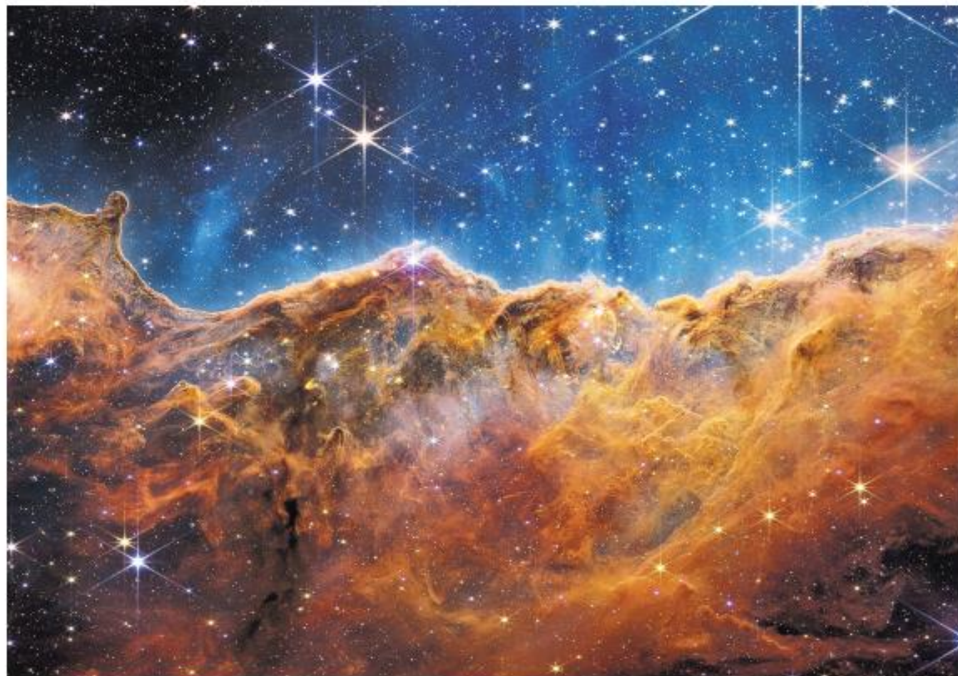
WHERE STARS ARE BORN The cliffs of the Carina nebula, captured by the James Webb Space Telescope. Its images revealed the earliest periods of star formation.

Midterm Race Appears Tight, Polling Shows