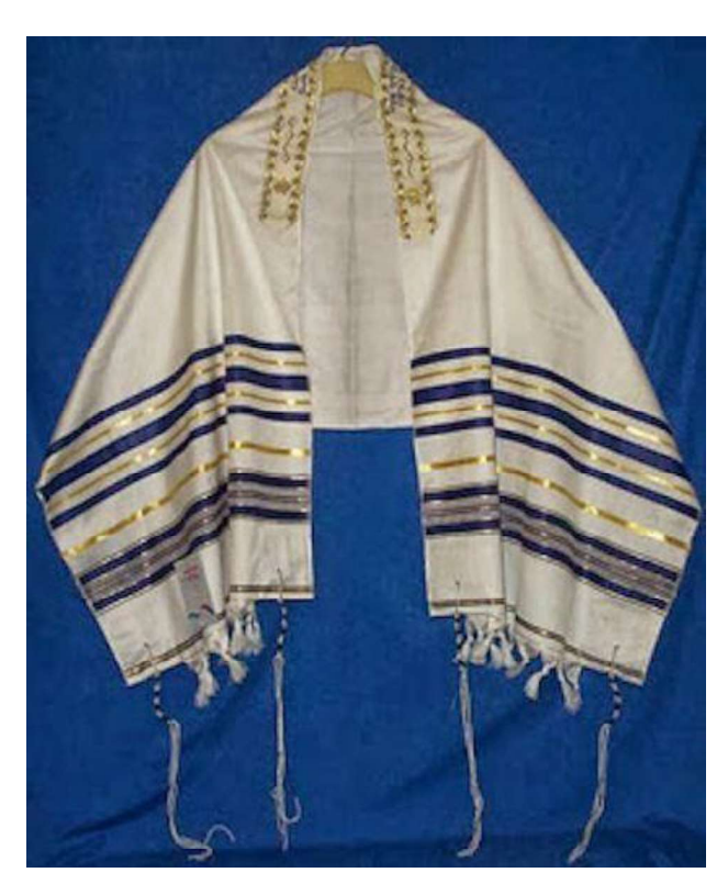
44 came up behind Him and touched the fringe of His cloak, and immediately her hemorrhage stopped.