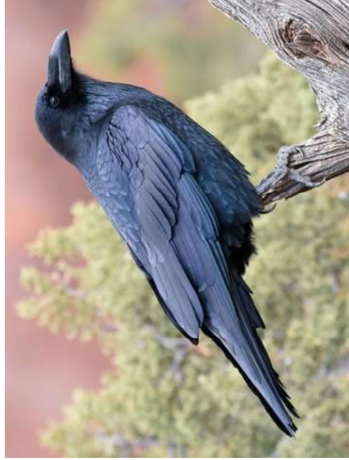
Illustration #1 – Study the birds.