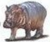
HIPPOPOTAMUS हाथीचंद्र चोंच