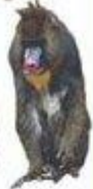
MANDRILL अजीबो लंगूर