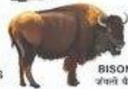
BISON जंघारी बैल