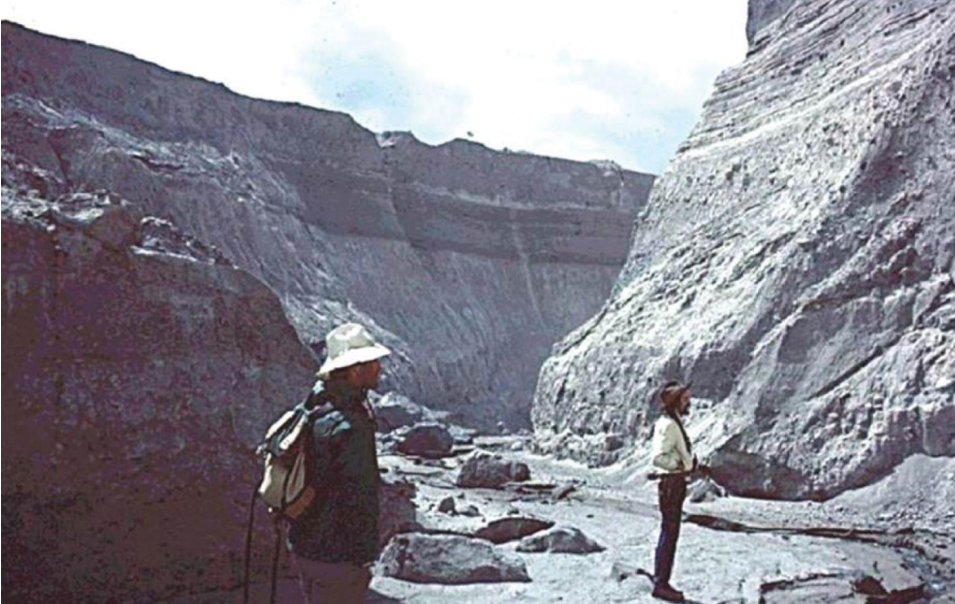
Geologists examine the canyon formed by a 1982 lahar, revealing layered deposits from 1980 and 1982 eruptions.

Adapted for use in accordance with federal copyright (fair use doctrine) law. Usage by ICR does not imply endorsement of copyright holders